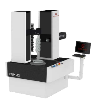
Picture 1: Measurement of a rotor at the analytical measuring machine KNM 4X

KAPP NILES is a globally operating group of companies with high-quality and economical solutions for finishing gears and profiles and is partner for companies from numerous industrial sectors in the mobility, automation and energy segments. The perfect interaction between machine, tool, technology and metrology enables extremely precise machining to a thousandth millimetre.